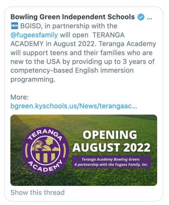
3:12pm · 15 Mar 2022 · Twitter for Android

Remember all those exciting things we said were happening?? Proud to share @BGISD as Fugees Family's first partnership of 50 over the next 5 years!