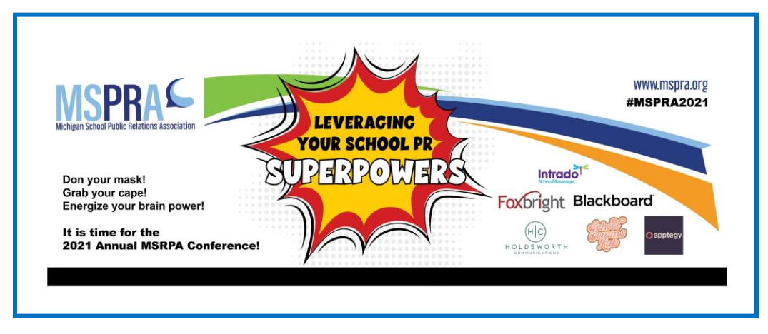
While we mix in some fun, MSPRA takes its professional development seriously.