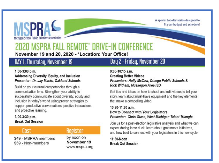
Along with electronic communication, members received a mailed postcard promoting the 2020 MSPRA Fall Remote Drive-in Conference.

Our conferences, sessions and speakers are chosen to build the abilities of our members and members of the school family.